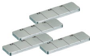
Calibration standards NFe 1.837.01-1110 Fe 1.837.01-1120 Aust 1.837.01-1130 Ti 1.837.01-1140