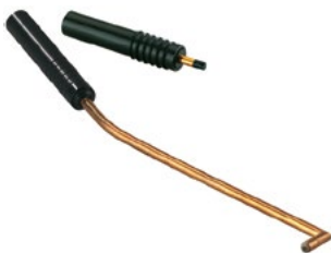
Eddy current probes