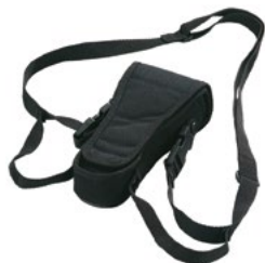
Carrying bag 1.837.01-7200