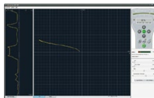
PC Software 1.837.01-8200