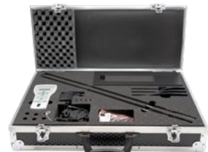
Airbus HFEC Inspection Kit 1.837.69-0038