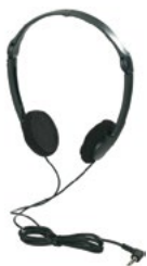
Headphones foldable 1.837.01-7400