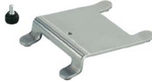
Holding device 1.837.01-7400