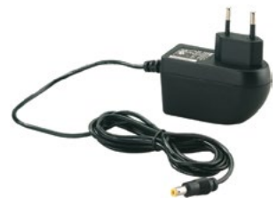
Universal power supply