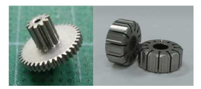
Figure 2: Examples for sintered metallurgical parts

When a part is passed through the coil, eddy currents are induced. If the specified quality is not met due to material mix-up, incorrect sintering or heat treatment, etc., the eddy currents shift. This change received by the receiver coil, and the part is being rejected.