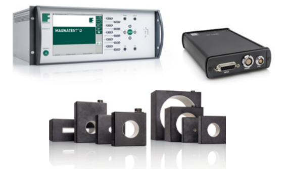
Figure 3: MAGNATEST D, MAGNATEST TCL and encircling coils

When a part is passed through the coil, eddy currents are induced. If the specified quality is not met due to material mix-up, incorrect sintering or heat treatment, etc., the eddy currents shift. This change received by the receiver coil, and the part is being rejected.