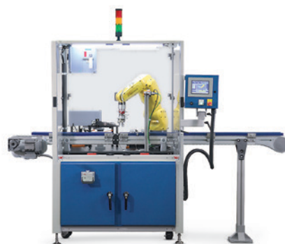
Fig. 2: Robotic cell for crack testing of sintered gear components

The robot arm picks up the component and rotates the component at a defined distance from the flexible probe (see Fig. 3). The test signals are processed immediately and lead to an automatic sorting of the components into good and bad parts. The bad parts are sorted out directly.