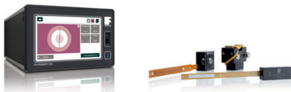
Fig. 1: STATOGRAPH CM+ and Flexprobes

To make the crack testing of sintered gear components as efficient as possible FOERSTER has developed a robotic cell for automated testing. Installed in the robot cell is a STATOGRAPH test device that carries out the evaluation and documentation of the test signals.