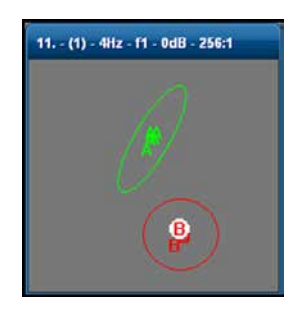
Fig. 3: Graphical presentation of the test results

For monitoring the autofrettage process, we recommend the MAGNATEST D test instrument in conjunction with an encircling test coil for determining the material properties of the test piece. This application solution enables continuous quality monitoring of the production process or an incoming gooods inspection. Further information about our products and industry solutions can be found on our homepage at: foerstergroup.com