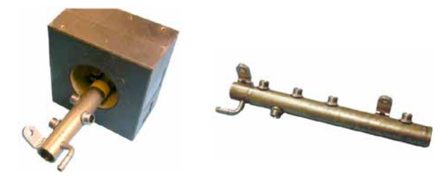
Fig. 2: Coil with test piece

In the series testing, all other measuring points are compared with the specified tolerance limits. The automatic sorting of the workpieces into good and bad parts takes place according to the respective test result.