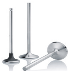
Figure 1: Valves

The inlet and outlet valves are among the most thermally and mechanically stressed components in an engine. After all, high engine speeds require a fast and precise closing of the valves on the valve seat inserts. Here, high temperatures of 800°-1000° C prevail, and even the smallest cracks can lead to valve failure. Furthermore, the valve stem also has to be specially hardened, since it rubs against the cam and is thereby subject to a particularly high load.