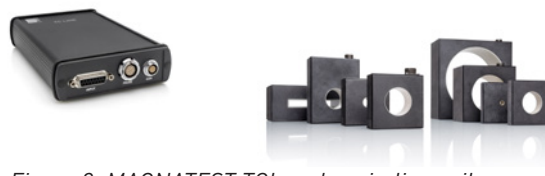
Figure 3: MAGNATEST TCL and encircling coils

For hardness testing of the valve stem, a magnetoinductive test method can additionally be used. The required module of the MAGNATEST product family can be easily combined with the STATOGRAPH.