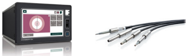
Figure 2: STATOGRAPH CM+ with various probes

In order to ensure that the material quality meets the requirements of the end customer, FOERSTER offers a fully automated crack and hardness testing system for valves. The proven eddy current testing instrument STATOGRAPH is used for crack detection in combination with highly sensitive sensors. It reliably detects longitudinal, transverse and point errors on the valve surface.