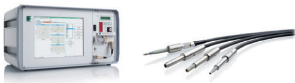
Fig. 1: STATOGRAPH ECM CE and different standard probes

The STATOGRAPH test instrument with one contour-guided and two stationary eddy-current probes is used for the crack testing of the gear shafts. Thus, the gear shafts are checked for longitudinal and transverse cracks.