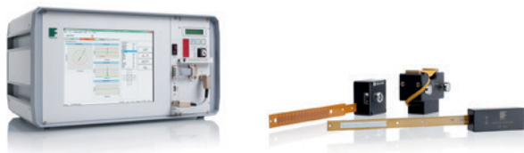
Fig. 1: STATOGRAPH ECM CE and Flexprobes

To make the crack testing of sintered gear components as efficient as possible FOERSTER has developed a robotic cell for automated testing. Installed in the robot cell is a STATOGRAPH test device that carries out the evaluation and documentation of the test signals.