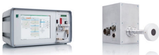
Figure 1: STATOGRAPH ECM CE with eddy current sensor

This makes it possible to detect open cracks and pores as well as imperfections located just beneath the surface of the material. Test throughput amounts to approximately 120 bores per hour.