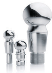
Figure 1: Ball pins

Ball pins, part of the ball joints, are a central component of landing gear. The safety-relevant vehicle component is produced in several production steps from annealed rod wire. In addition to standard components (e.g. according to DIN 71803) customer specific sizes are produced with special geometries. Non-destructive eddy current testing is recommended to determine that the material surface of the ball pins does not include any defects.