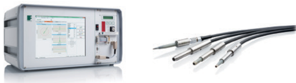
Figure 2: STATOGRAPH ECM CE with standard probes

The FOERSTER STATOGRAPH eddy current testing instrument monitors the material surface of the ball pins automatically for longitudinal, point and transverse defects. This is done directly in the production line with a performance of approx. 600 parts per hour. For the testing, one or more eddy current probes are used as required.