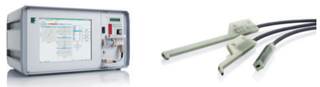
Fig. 2: STATOGRAPH ECM with angled probes

The material surface of the axle pivots can also be inspected for surface defects such as cracks. Due to the modular structure of the test electronics, an individual adaptation to the production process is possible.