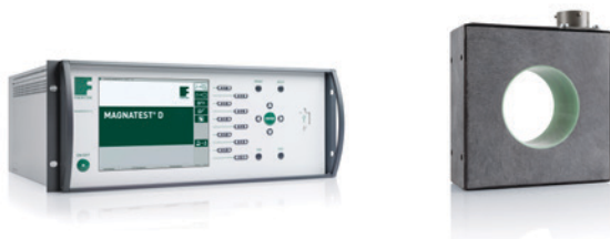
Fig. 1: MAGNATEST D with through-type test coil

FOERSTER offers the MAGNATEST product family for fully automated testing of material mixes and inspection of heat treatment conditions. In line with the customer's individual requirements, the MAGNATEST testing instruments in combination with the corresponding test coils allow a 100% inspection of the axle pivots.